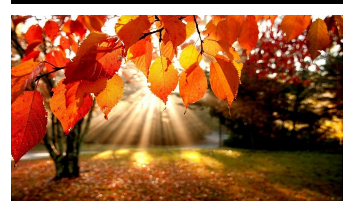
What does the Task Master Say about September?

(send in your questions for Task Master to Lakeipad@mail.com)_