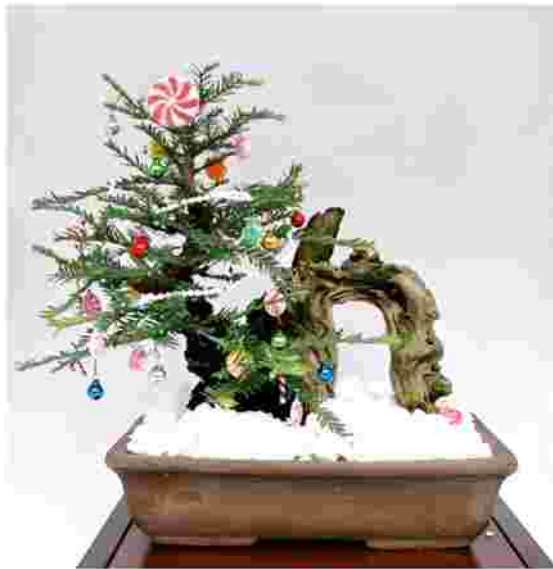
Candyland Christmas by Candace Key