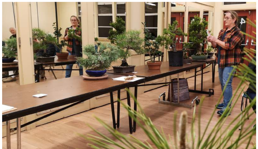
Diane takes some pictures of the trees from our Member Tree Critique session.