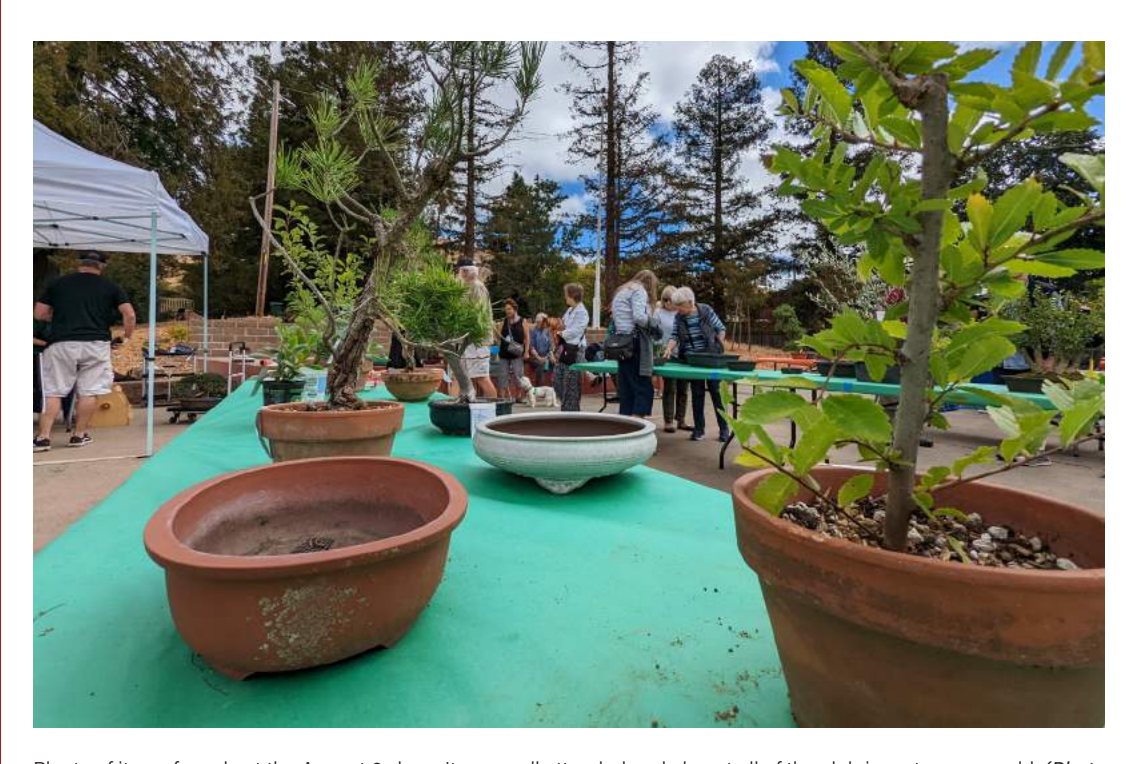
Plenty of items for sale at the August 6 show. It was well attended and almost all of the club inventory was sold.