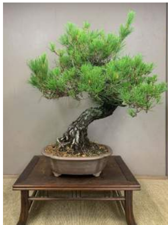
A Japanese black pine before (left) and after (above). Tree and photo by Jay McDonald.

Submit your trees for show and tell! Please send your materials to tung@marinbonsai.org by the 15th of each month to be featured.